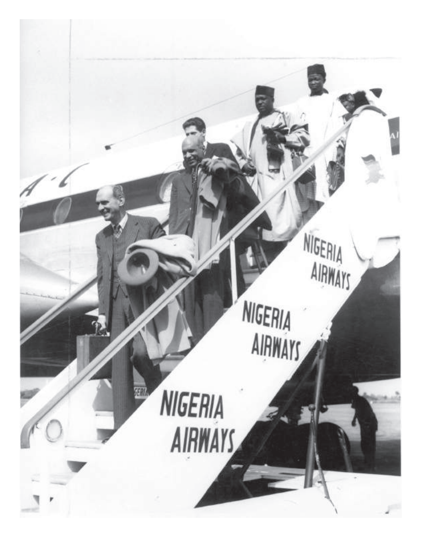
Figure 11: ILO Director-General David Morse arriving to the First African Regional Conference, Lagos, Nigeria, 1960.

international agencies to both launch large size programmes and get involved more directly in the developing countries' planning processes. Campaign-style programmes were also in line with new techniques tested by international agencies to reach out to a broader international public through cooperation with NGOs and academic partners. The WEP has to be seen in the context of a whole series of similar campaigns taking off from within the United Nations system during the 1960s and 1970s. Examples are the FAO's Freedom from Hunger Campaign