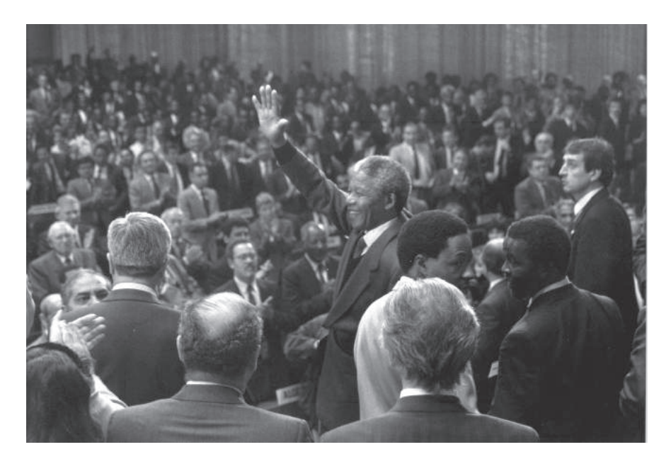
Figure 14: Nelson Mandela at the 77th Session of the ILC, 1990.

While unleashing an ever-increasing flow of goods and capital on an unprecedented scale and opening opportunities for businesses to expand, globalization has, at the same time, restricted the capacity of countries to control the economic forces working within their own national borders. As a consequence, governments – some more voluntarily than others – have abdicated some of their means to pursue social and employment goals, under the impression of presumably irrefutable demands of globalization. For the ILO, these developments and the debates accompanying them, spelled immediate dangers. Already during the late 1970s and 1980s some of the certainties - and indeed the foundations and premises on which the ILO's work had rested ever since the Second World War began to erode. If national governments and national trade union federations were losing part of their capacity to steer economic and social policies on the state level, the ILO would necessarily lose part of its influence, too.