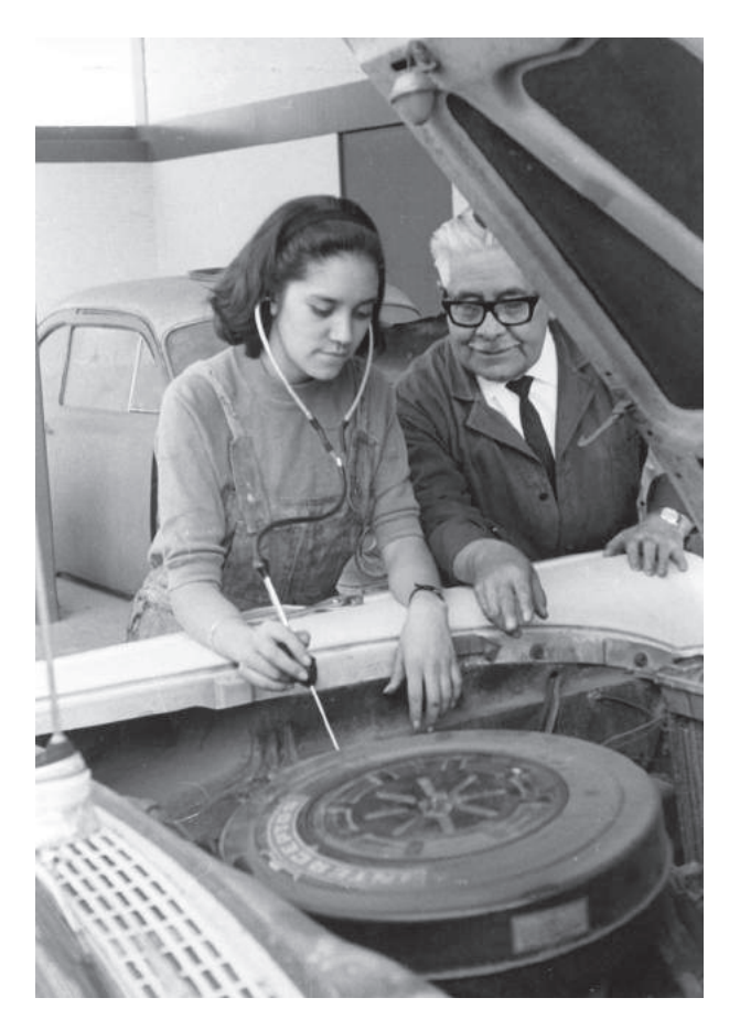
Figure 9: Training course in car mechanics, International Training Centre of the ILO, Turin, 1960s.

ception that "more scientific" approaches were necessary to gain credibility, both with the public and vis-à-vis other organizations carrying out similar functions. 433