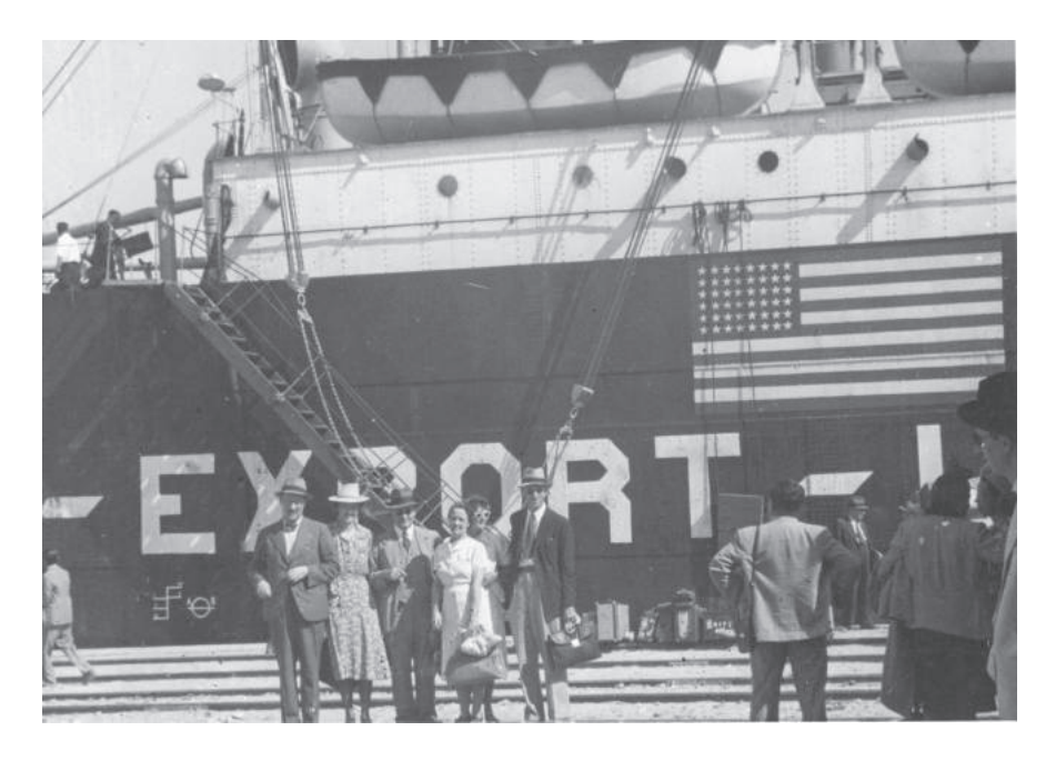
Figure 6: Group of ILO staff in Lisbon, waiting to board a ship to Canada, 1940.

ity had to be laid off. All in all, about 40 members of the ILO's staff travelled secretly through French and Spanish territories to Lisbon. From the Portuguese capital – where thousands of people fleeing persecution and war were desperately waiting for passage to a safe haven overseas – the group eventually boarded the steam liner Excambion , leaving Europe for an uncertain future.