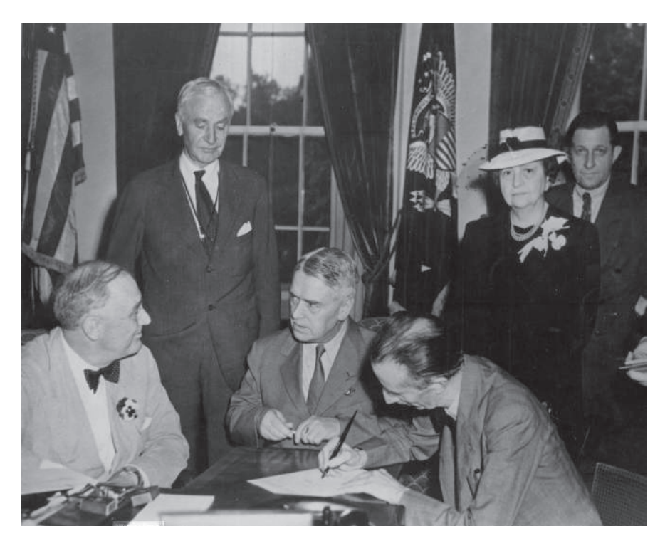
Figure 5: ILO Director-General Edward Phelan signing the Declaration of Philadelphia with Franklin D. Roosevelt, President of the United States, at the White House, 1944.

form upon which the ILO could secure its place in the post-war order, as the result of factors that its leadership and its most devoted supporters could only partly control.