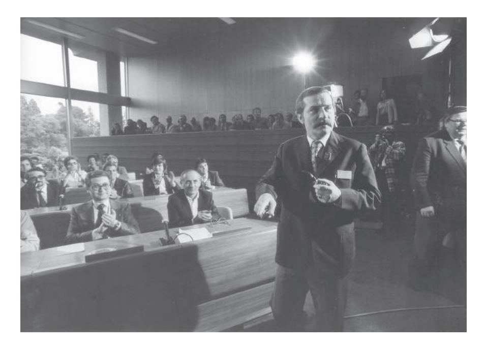
Figure 13: Lech Wałęsa at the 67th Session of the ILC, 1981.

(which, in return, received the backing for another resolution denouncing Israel). In March 1983, however, the Governing Body decided to establish a Commission of Inquiry, which found that there was no legal basis for the ban of Solidarnosc . The Polish government, supported by other socialist countries reacted with great indignation to the Commission's report which was submitted to the Governing Body in June 1984. In November of the same year, Poland submitted a notice announcing its intention to withdraw from the ILO within the regular two-year period. At this point, and despite continuing protests from the Workers' group, the ILO softened its approach towards Poland in order to keep the door for membership open. Martial law restrictions were progressively relaxed, and Solidarnosc could legally function again in 1986. Poland postponed its withdrawal and then actually never left.<sup>614</sup> By that time, the pace for changes in the region was set by the policy of perestroika under the new Soviet leader Mikhail Gorbachev. As one of the consequences of this change, the Workers' representatives of the formerly monolithic communist bloc were no longer obliged to vote in accordance with