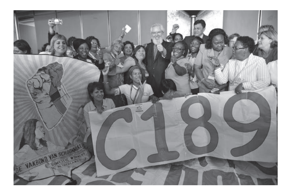
Figure 16: Representatives of domestic worker organizations celebrating the adoption of the Domestic Worker Convention (No. 189) with ILO Director-General Juan Somavía at the 2011 ILC.

ILO's long history of engagement with informality, which started in the 1970s with the World Employment Programme. ^{711}